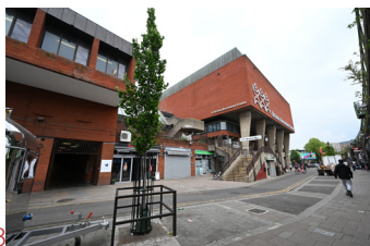
3 Brixton Recreation Centre SW9 8QQ