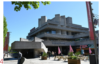
14 National Theatre SE1 9PX