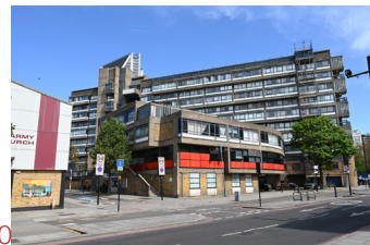
10 Perronet House SE1 6ET