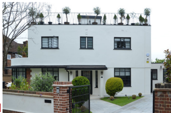
1 10 Dorchester Drive SE24 0DQ

Charles Jencks, an architect and architect critic once wrote that Modernism was dead, that it died on the 15th July 1972. But I don't agree with that and hope that if you are here listening to this and doing this walk that you also believe that Modernism is living. This tour is designed and built for the Modern lover, for someone who wants to spend their time with beautiful buildings. Buildings that often aren't celebrated as much as they should. On this tour you will visit 16 Modern buildings and estates all in south London. A part of London that is visited less by tourists but in my opinion a part of London with more life, more love and more of a story waiting to be told. This tour is telling you the story of these buildings, keeping them alive. Their live is living through you and your love for them.