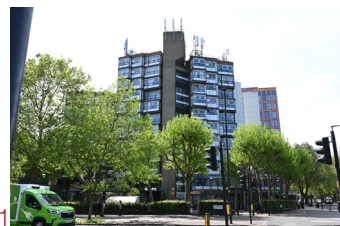
11 Lambeth Towers SE11 6NJ