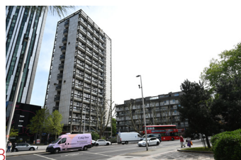
8 Draper Estate SE1 6TH