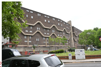
2 Southwick House SW9 8TW