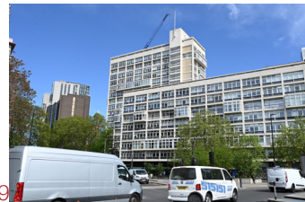
9 Metro Central Heights SE1 6BW