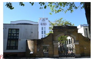
16 Alaska Factory SE1 3BA