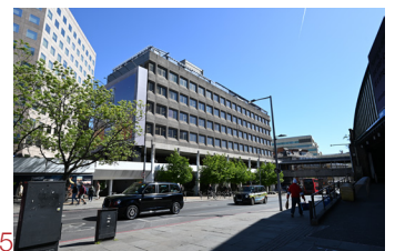
15 Colechurch House SE1 2SX