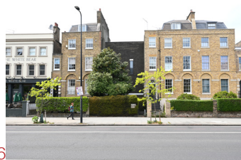
6 134 Kennington Park Road SE11 4DJ