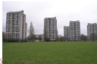
5 Brandon Estate SE17 3NW