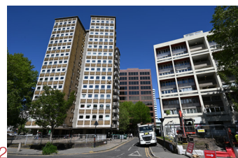
12 Beckett, Canterbury and Stangate House SE1 7EQ