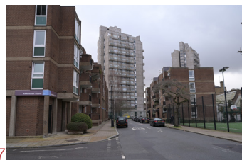
7 Cotton Gardens Estate SE11 4NX